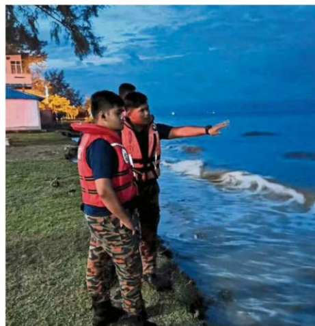
Fire and rescue personnel surveying the coast along Port Klang prior to the high tide phenomena expected on Oct 17.

The areas on the list in Klang are Kampung Tok Muda, Kampung Sungai Pinang in Pulau Indah, Pandamaran, Taman Selatan