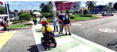
MPSI has improved infrastructure for disabled pedestrians, including six pedestrian crossings in Tropicana LSI. — Fpaz

Call for equal treatment of mentally and physically challenged