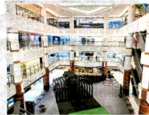
SUASANA tenang di Bangsar Shopping Centre (BSC) selepas kakitangan sebuah premis didapati positif Covid-19.

Orang ramai dinasihatkan untuk sentiasa berada di rumah jika tiada keperluan penting