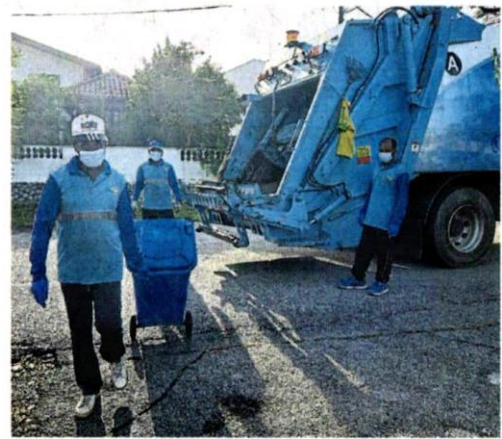
时都必须做好防疫措施。 达鲁益山垃圾管理有限公司所有员工, 履行服务

她强调, 人人都有责任保护自身健康和安, 并遵守相关单位给予的指示, 确保新冠肺炎病毒不再传播。