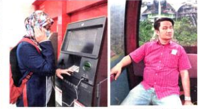
The World Bank is reportedly investigating with a special ATM having Braille keypad and voice guide through headphones or earphone.