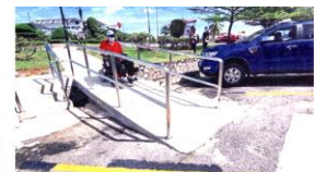
Six ramps have been constructed in Tropicana LSI following the MS 1188-2014 Malaysian standard as part of MPSI's Barrier Free City pilot project for the benefit of disabled pedestrians.