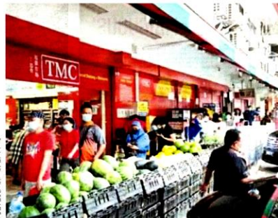
A long line of people waiting in an aisle at a busy market stall in Kuala Lumpur.

SELANGOR and KUALA LUMPUR have been placed under Conditional Movement Control Order (CMCO) to forestall a surge in Covid-19 cases from the third wave of the virus, which has been placed under the CMCO, although a day earlier yesterday. The move is part of a pre-emptive move to contain the virus before it spreads further, says the state government. Malaysia Deputy Prime Minister Anwar Ibrahim said the move was necessary to prevent a surge in cases, which could overwhelm the health system. The CMCO will be in effect until Oct 27 for Selangor and Oct 26 for Kuala Lumpur.