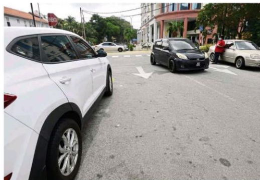
Some drivers like the one in this white car (left) are caught unawares by the change in traffic flow on Lorong Tingkat that is now a one-way street.

"Lorong Tingkat's one-way traffic movement will take effect from Oct 19 and council enforcement officers will monitor the situation," he said.