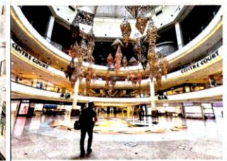
PUSAT beli-belah Mid Valley beroperasi seperti biasa selepas seorang pekerja premis positif Covid-19.