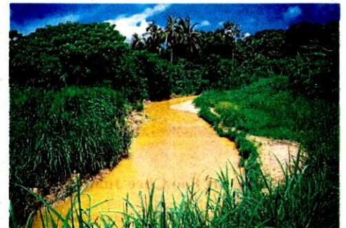
Samples taken from Sungai Batang Benar in Negri Sembilan have been sent to Chemistry Department for analyses, pending results.

The pollution caused two water treatment plants in Sungai Semenyih and Bukit Tampo to halt