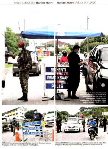
PKPD dilaksanakan menjelang petang tadi, di kawasan sekitar Putrajaya Golf and Country Resort, Putrajaya. ANGGARA, PKPD bermula sekitar 4PM di beberapa titik di Jalan Raja Bongsu, Marang bagi menentang penularan virus Covid-19.