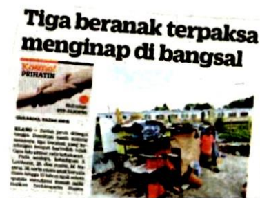
KERATAN Kosmo! semalam.

dengan pihak lain bagi menyediakan barang keperluan rumah,” ujarnya.