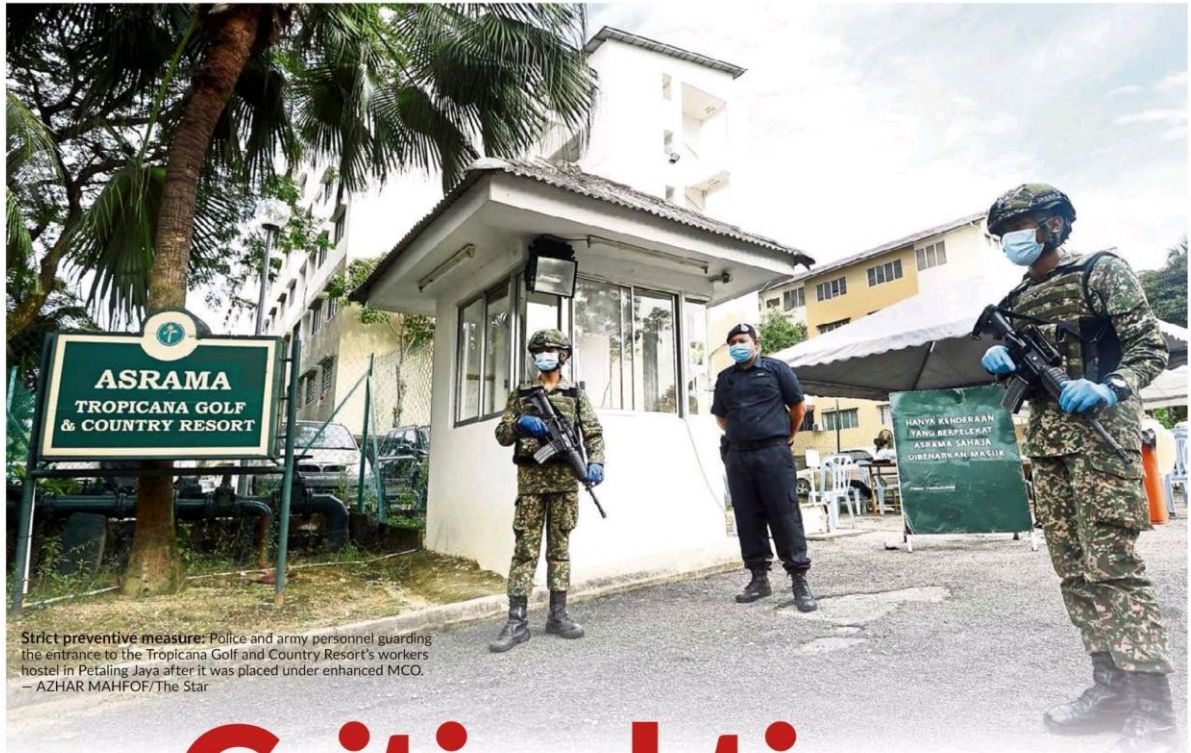
Strict preventive measure: Police and army personnel guarding the entrance to the Tropicana Golf and Country Resort's workers hostel in Petaling Jaya after it was placed under enhanced MCO.